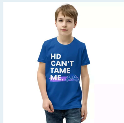
HD Can't Tame Me Youth Short Sleeve T-Shirt $18.00