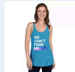
HD CAN'T TAME ME Women's Racerback Tank $25.00