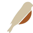
The Stamped Robin