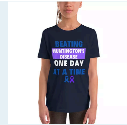
Beating HD Youth Short Sleeve T-Shirt $18.00