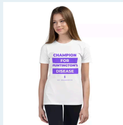
HD Awareness Youth Short Sleeve T-Shirt $18.00