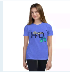
Champions for HD Youth Short Sleeve T-Shirt $18.00