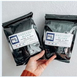
Champions for HD "The Knockout Blend" Ground Coffee $13.00

Champions for HD merchandise helps promote our brand & cause while providing funds to further our mission. Every purchase helps us do good works within the HD/JHD community. We appreciate your support!