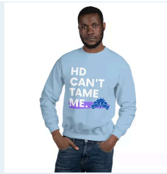
Unisex Sweatshirt $30.00